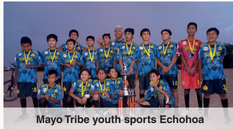
Mayo Tribe youth sports Echohoa