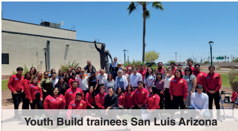
Youth Build trainees San Luis Arizona