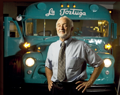
"La Tortuga" 2007