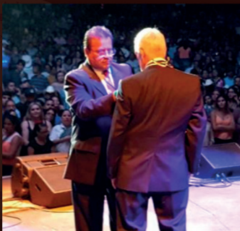
Mexican Ohtli diplomatic award 2016