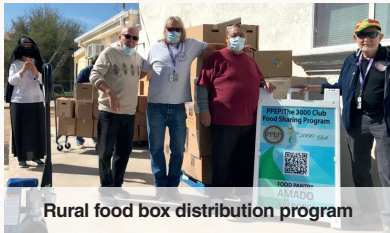
Rural food box distribution program