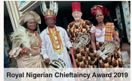
Royal Nigerian Chieftaincy Award 2019

lived in Guadalajara, Mexico, he knew first-hand what it was like to live in an unfamiliar society with a different language and culture. So, in his portable classroom, he began teaching English and basic education to the same Bracero farmworkers he had ministered to in the past, helping them prepare for life in America, by gaining a practical education. Hence, Portable, Practical Educational Preparation's mission is to improve the quality of rural life.