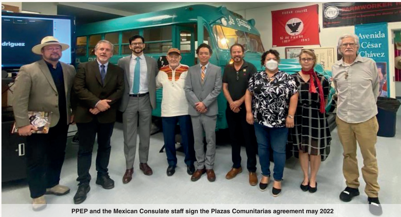
PPEP and the Mexican Consulate staff sign the Plazas Comunitarias agreement may 2022