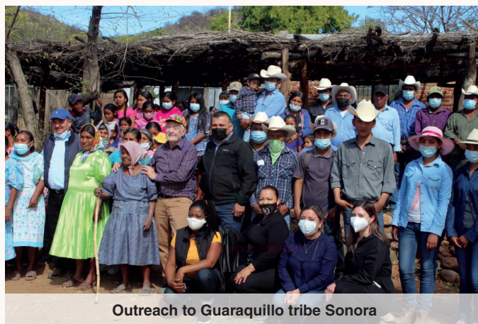
Outreach to Guaraquillo tribe Sonora