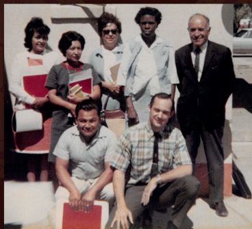
PPEP's First Staff 1967