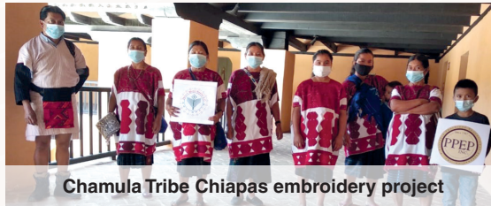
Chamula Tribe Chiapas embroidery project