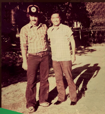
Cesar Chavez La Paz 1978