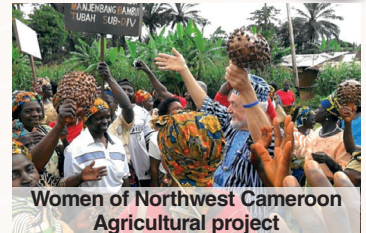
Women of Northwest Cameroon Agricultural project