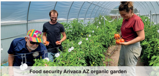
Food security Arivaca AZ organic garden

lived in Guadalajara, Mexico, he knew first-hand what it was like to live in an unfamiliar society with a different language and culture. So, in his portable classroom, he began teaching English and basic education to the same Bracero farmworkers he had ministered to in the past, helping them prepare for life in America, by gaining a practical education. Hence, Portable, Practical Educational Preparation's mission is to improve the quality of rural life.