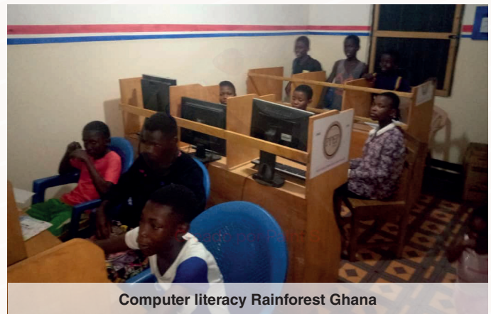
Computer literacy Rainforest Ghana

In education PPEP Tec High School ( ppeptechs.org ) was created in 1996 to give students a second chance to learn. PPEP Tec HS is a public school, free of charge, and offers an official diploma when graduating, same as any other public school. Classes are for day time and night time students that may work. PPEP also offers free online schooling through its partner STRIDE k-12.