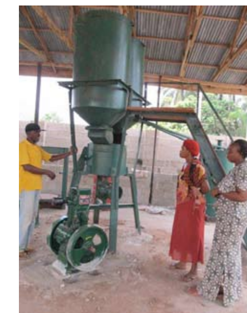
The ladies of the Awo Mberi Woman's Palm Nut Oil, 'hybrid' Processing plant