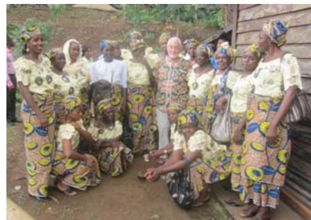
Alpha Micro Credit Association