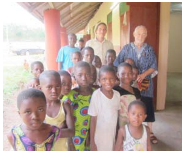
Students in Ghana newly renovated School Building