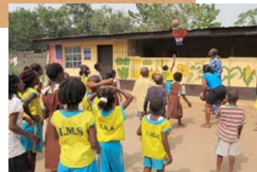
Academy for Success- a charter school prototype.