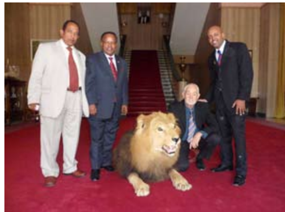
Ethiopian Presidential Palace