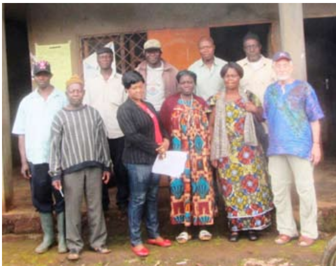
The Bambui Micro Credit Board

Upon invitation by the Fon (King) from the Bambui Kingdom in North-west Cameroon; I traveled to Douala the first week of July 2012. Upon arriving at the airport I was greeted by a local delegation and transported to a meeting hall where a traditional welcome awaited me. The next morning I awoke to the roar of the Atlantic Ocean outside my in Limbe, which is nestled to Mt. Cameroon, the second largest mountain in Africa and the rainiest place on earth. This paradise is where many of the domesticated African plants and crops were cultivated at the Limbe Botanical Garden that date to the 1890's Cameroon is divided several ways; English and French speaking, modern and traditional, mountain and plains, rain forest and arid lands. Most of its people are diverse with big city dwellings and traditional villages in remote kingdoms (Fondoms) known as Quarters. Each Quarter or village has a