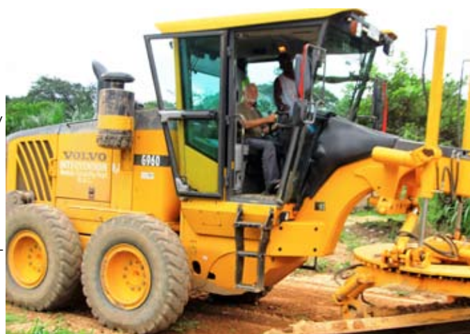
Road Improvement Project