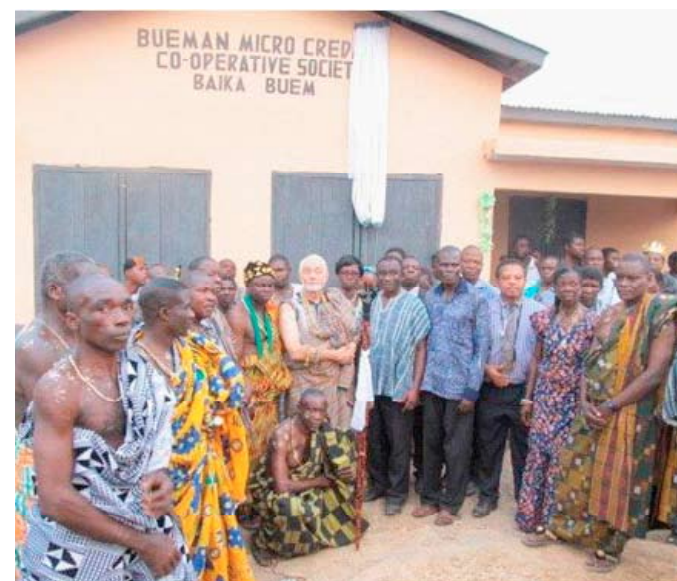
Bueman Microcredit office