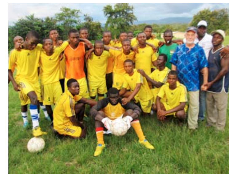
Eagles Soccer Team Ghana

Soccer: As mentioned before soccer is king in Africa. PPEP, Inc. supports a soccer team, known as the Eagles representing the Buem Kingdom in Ghana. These young players range from 16-21 years and have excelled from amateur to semi-pro in just two years. In Owerri, Nigeria, there is a girl's high school soccer team, where all the students are deaf and mute.