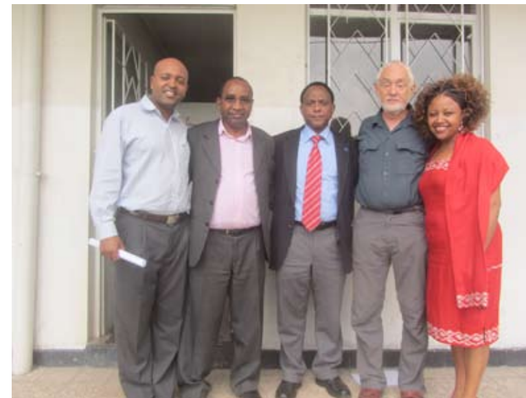
Ethiopian Diabetes Association

This December, the President of Ethiopia Girma Wolde-Giorgis has invited Dr. Coun-