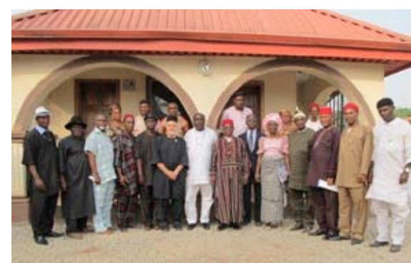
King's and Chiefs of 10 Kingdoms gathered to pay tribute to and offer prayers for Gabrielle Giffords.

tanks in their back yards and grow the fish and sell in the open market. This takes the poor from giving them a fish, to teaching them to fish and their loan helps them to market the fish.