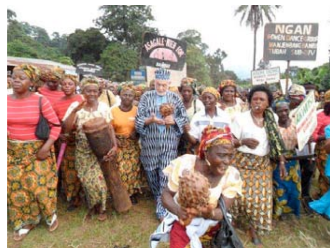
African Women in Action