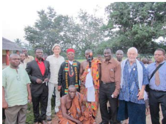
WARES Inaugural ceremony