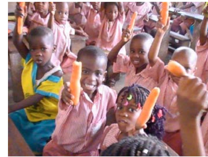
children's organic feeding program

tanks in their back yards and grow the fish and sell in the open market. This takes the poor from giving them a fish, to teaching them to fish and their loan helps them to market the fish.