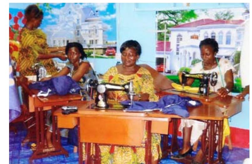
High Tech Tailoring Shop- (business incubator) seamstress with Diabetes