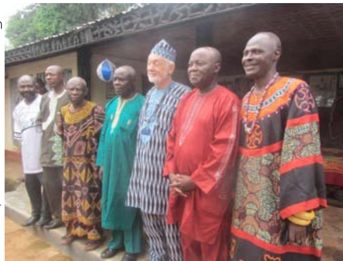
Greeting the Royals at the Bambui Palace

After the Royal feast, I retired to Mama's House, which is an orphanage of sorts for Mali refugee children. Mama an African American widow in her