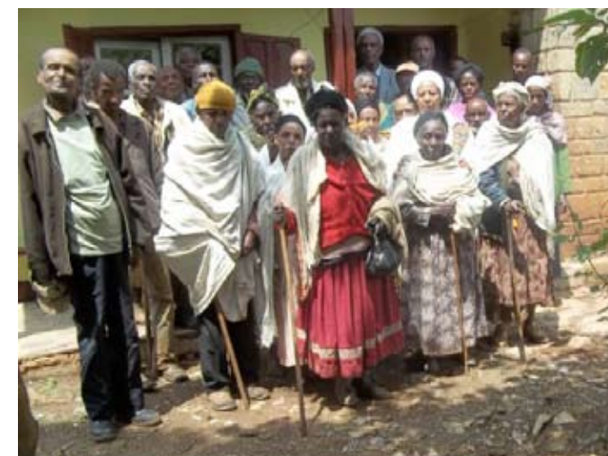
Bati Senior Nutrition Center