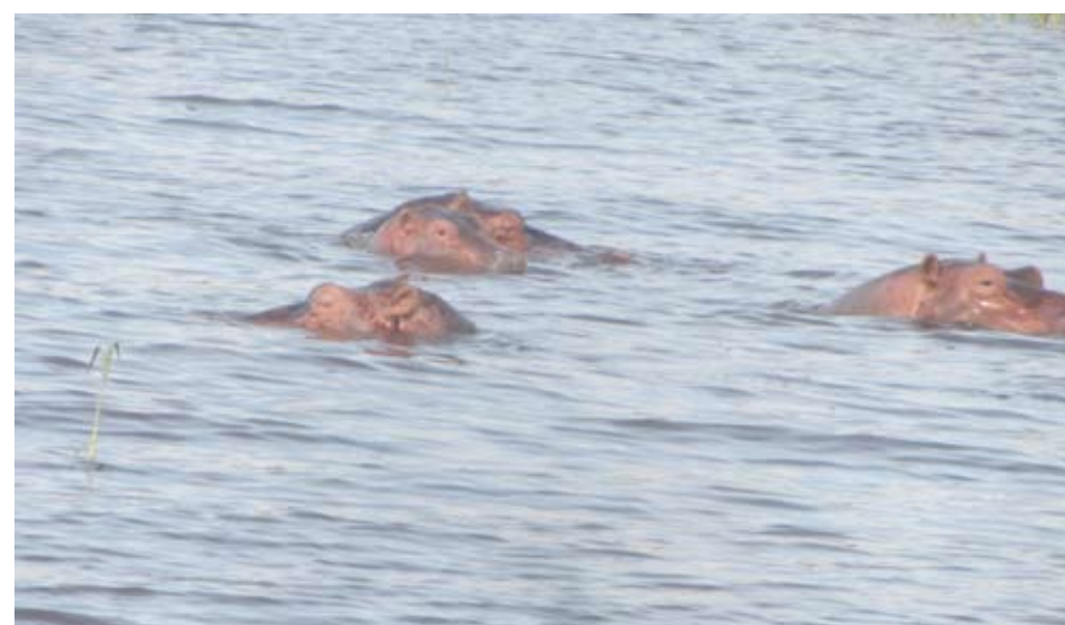
WaDF Botanical Garden - AWASSA