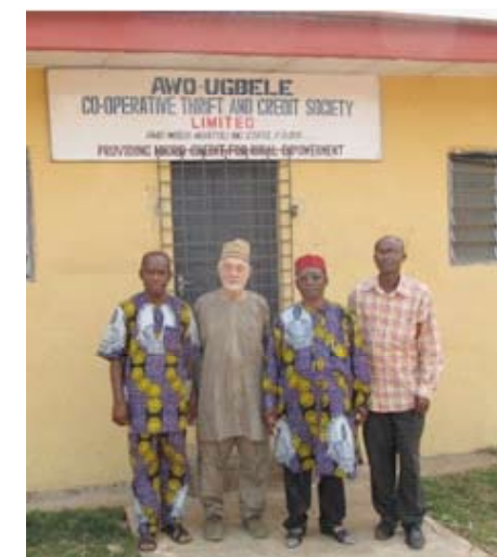
Awo Mberi micro lenders

The idea is to take the micro credit program for single borrowers and put it under the same umbrella as the cooperative lending or multiple borrowers to make lending more efficient and create mentoring and bartering among the borrowers.