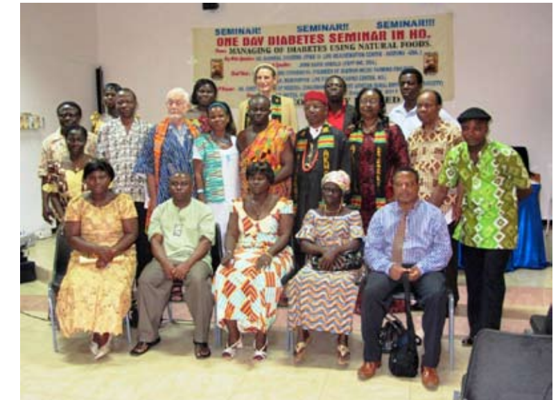
Ghana Diabetes/ Organics Seminar