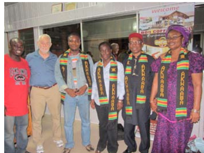
Meeting of Chiefs from Ghana and Nigeria