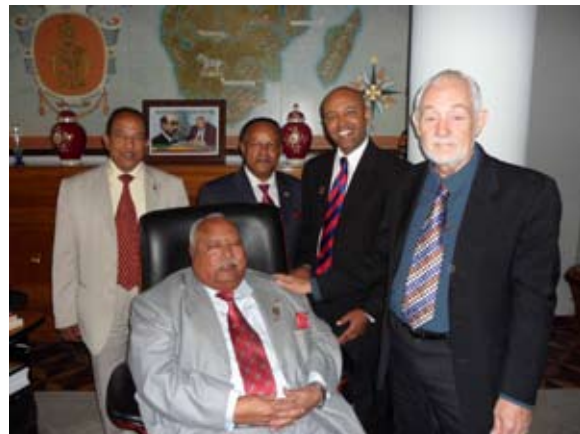
Greeting President Girma Wolde-Giorgis