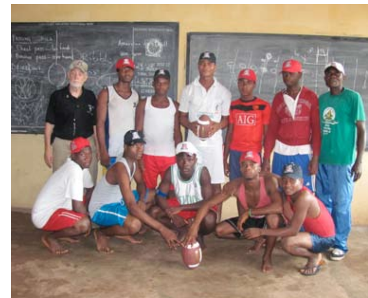
Deaf/ mute athletes Nigeria

This sport was picked up rapidly as they used the soccer field. The only obstacles were the temptation to kick the ball. Occasional an open field tackle was substituted to pulling the flag. The jerseys for all the sports were grey and maroon "PPEP TEC High School Shirts." Blue and red University of Arizona sports caps distinguished the team as blues and reds. So if you go to Ghana do not be surprised if you see University of Arizona sport shirts and caps. One observation made came from the sports camps participants, which was American sports use the hands more and Africans' use their feed. By learning each other sports made them better all-around athletes.