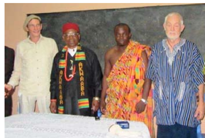
WARES Board of Directors