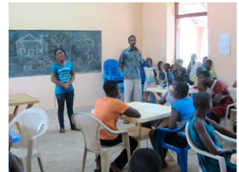
Youth hygiene class