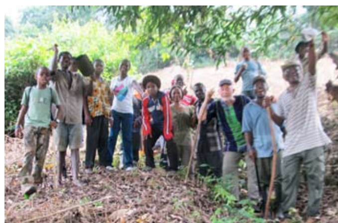
Mountain Hike to Baika ancestral home