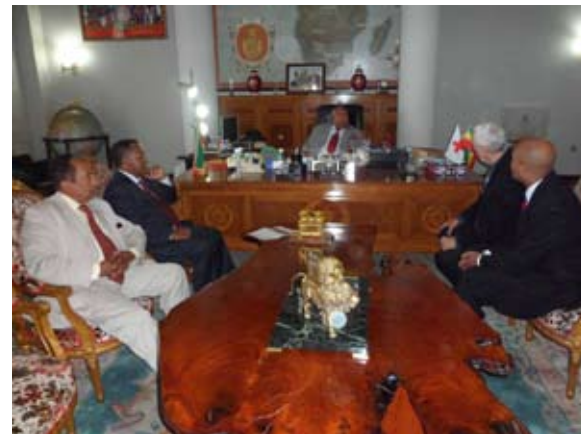
The Presidents Office